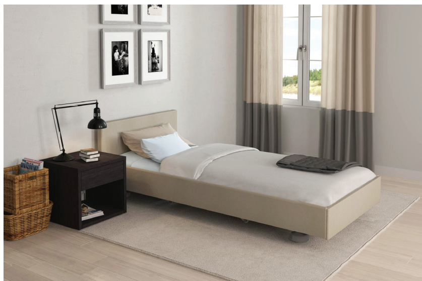
Basso with closed bottom